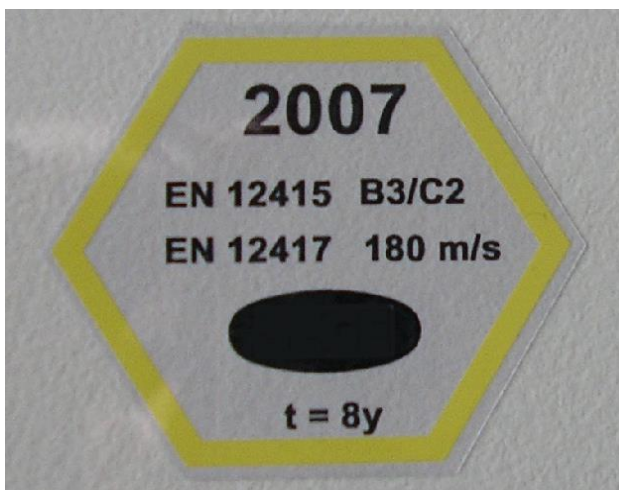
Figure 2 – Example of indicating the year of construction (period of use, here t = 8 years)

The improper use of the protective vision panels, e.g. beyond the „date of expiry“ or an ongoing use of a damaged window may result in the consequence that the liability passes from the manufacturer to the user (if the vision panel is not replaced in time).