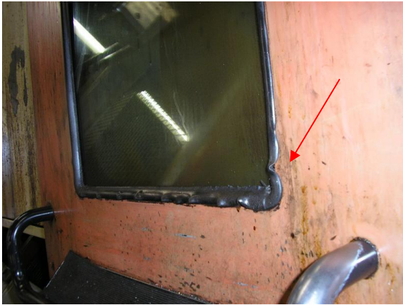
Abbildung A5 – Swelled panel sealing due to metalworking fluid. The lateral tightness to the polycarbonate panel edges is no longer existent (applies also to cracked panel sealings)